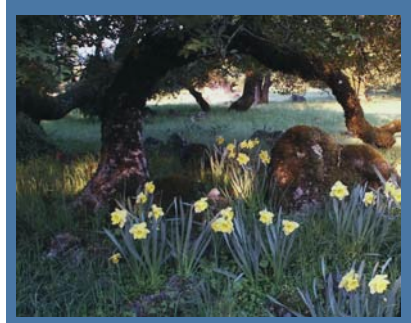
Springtime Daffodils on George Ranch