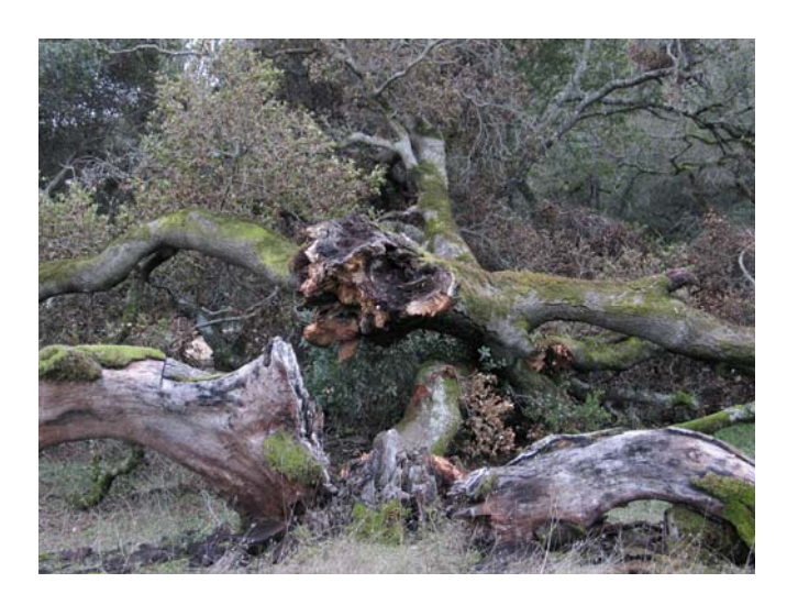
The fallen Oak from our parking lot