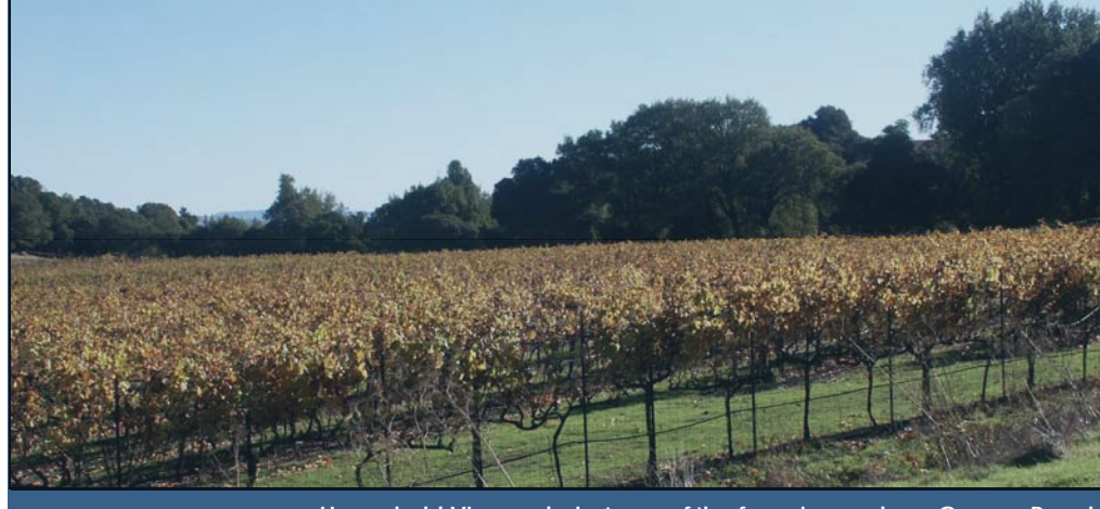
Hengehold Vineyards, just one of the four vineyards on George Ranch