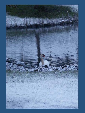
Missy in Wintertime

Always wanted to be published? You can! Write an article for The Grapevine!.