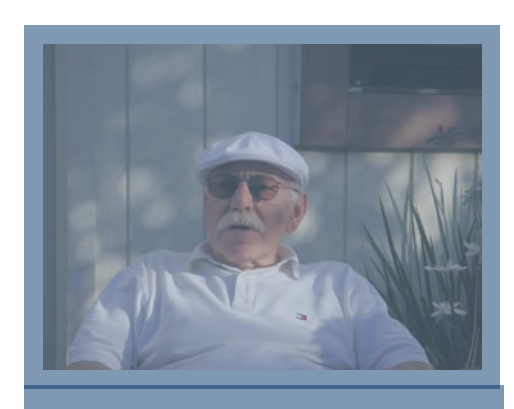
Our esteemed restaurant reviewer (head on – not in profile!

Jack's is open for lunch and dinner with